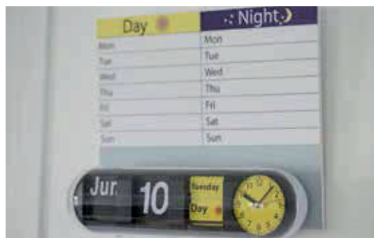
Calendar Flip Clock