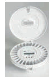
Automatic Pill Dispenser

The monitoring centre will then follow the procedure agreed with the family. For example, if someone wearing a Falls Sensor, falls to the ground and doesn't get up this will activate the monitoring centre to contact the person at home to check they are ok, and/or telephone the nominated contacts.