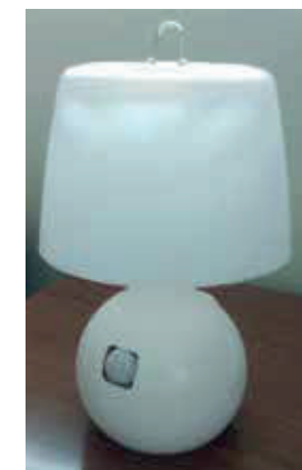
Motion Sensor Lamp